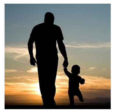
Involve yourself with your children.

Here are some suggestions that will help win this battle for your child's spiritual well-being: