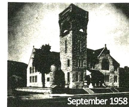
3610 Grandel Square, St. Louis

District Conferences were added later as the IMA grew in number. According to early records, it seemed conventions were held in states. For example: