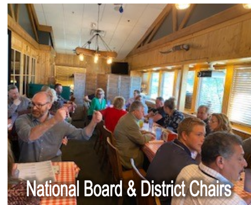
National Board & District Chairs