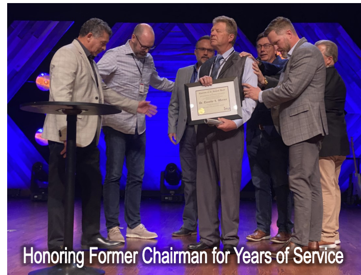
Honoring Former Chairman for Years of Service