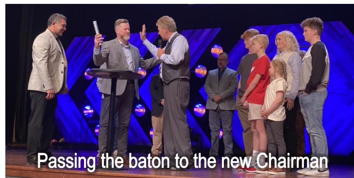
Passing the baton to the new Chairman